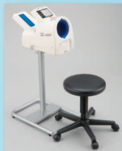
Optional stand & chair